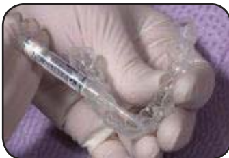
Applying whitening agent