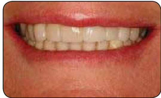
The result is a dazzling smile