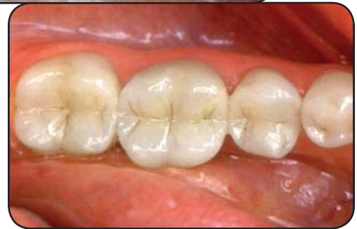
White restoration - before & after